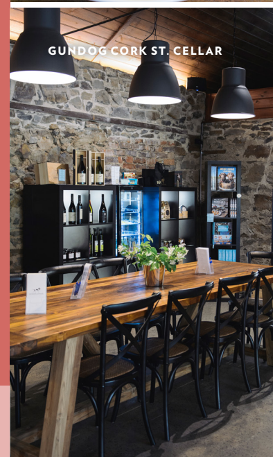
GUNDOG CORK ST. CELLAR

Please note: Suggested itineraries are based on a Saturday overnight stay. If undertaking the itinerary on an alternative day, please check with the relevant venues for opening times or contact the Yass Valley Information Centre for assistance with planning a tailor-made itinerary to suit your needs and travel dates. Contact details, additional information and alternative options for accommodation, dining and experiences can be discovered at yassvalley.com.au or by phoning the team on 1300 886 014. *Bookings essential