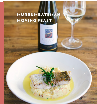
MURRUMBATEMAN MOVING FEAST