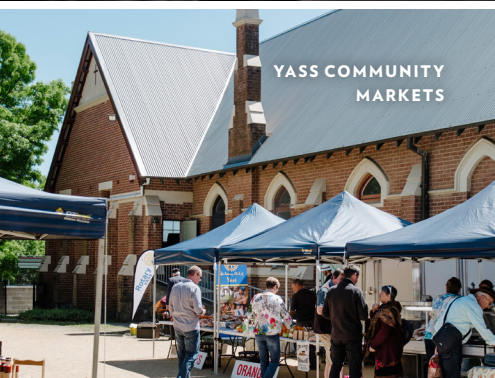
YASS COMMUNITY MARKETS